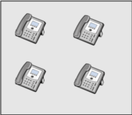
Accounts & Management