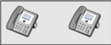
Restaurant / Roomservice